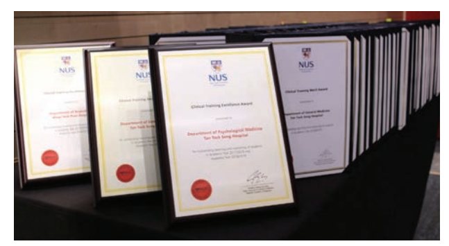
NHG bags 63 Awards at NUSMedicine Dean's Appreciation Awards